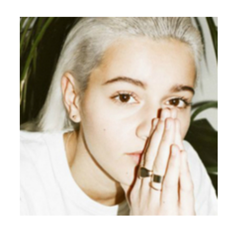
REEPERBAHN DELEGATE DISCOUNTS