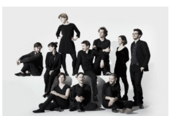
ENSEMBLE PRIZES '23 TO EKMELES AND NAMES

The Ernst von Siemens Music Foundation awards the two Ensemble Prizes '23 to the vocal ensemble Ekmeles from New York and the Salzburg-based New Art and Music Ensemble NAMES